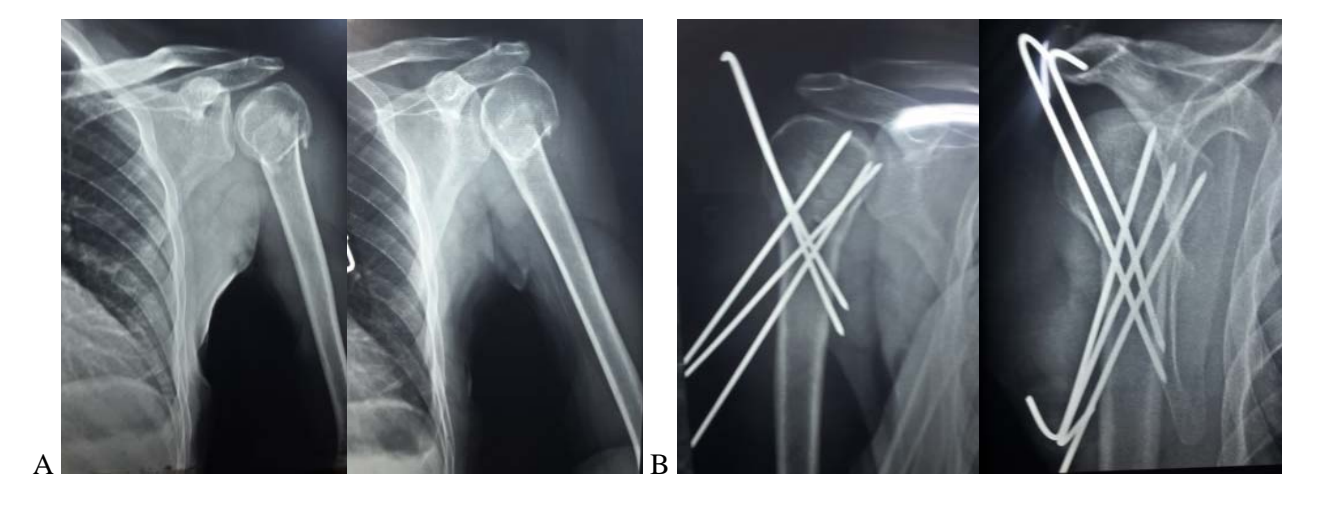
Fig. 2a: Pre-operative AP and Lateral radiographs of proximal humurs fracture in Group 2. b: Post-operative AP and lateral radiographs of fracture following K-wire fixation.

dence of union, more aggressive motion and rotational exercise are then applied to regain range of motion of shoulder at two months after surgery.