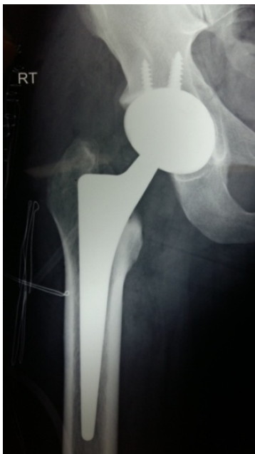
Fig 3: Postoperative x-ray of primary total hip arthroplasty done with anterior approach.

Immediate postoperative X-ray was done for all patients to assess component alignment and stability and was repeated with every follow-up. Follow-up was done 3 weeks postoperatively for the removal of stitches, then regularly at 6 weeks, 12 weeks then every 6 months for the first 2 years postoperatively. Our results were evaluated according to the Hospital for special surgery—hip rating system.[11]