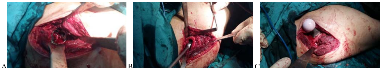
Fig(2): showing (a) acetabular preparation, (b) femoral preparation and (c) prereduction femoral and acetabular components application.

Regarding Group B, patients were positioned in the dead lateral decubitus position. We suspended the gluteus medius and gluteus minimus on stay sutures